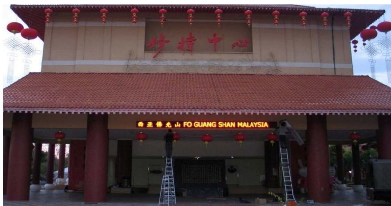
P10 Semi-Outdoor Messaging Board (Red)