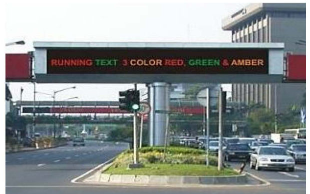
P16 Tricolor Messaging Board